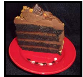
"Death by Chocolate" ..... 5.99 A decadent Four-Layer Chocolate Cake The ultimate Chocolate Lover's Dessert!