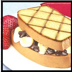
"Southwest S'More" an Arizona Grill Specialty..... 4.99 A decadent childhood delight that even adults will love! Treat yourself to our delicious version of a campfire legend featuring pound cake, chocolate and creamy marshmallows grilled on an open flame....incredible!