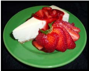
New York Style Cheesecake..... 4.99 with Strawberry Topping